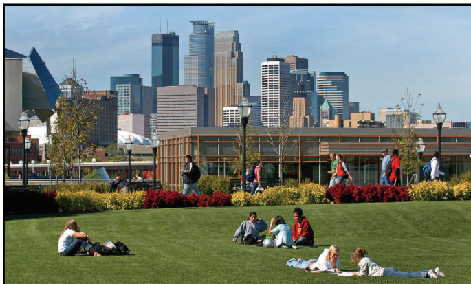
Students enjoy a beautiful day at the University of Minnesota

The University of Minnesota Retirees Association (UMRA) , will host the 2014 AROHE conference at the Commons Hotel in Minneapolis, MN, August 10 – 13. The Big Ten Retirees Association will hold its annual meeting in the same location August 8 – 10, providing an opportunity for valuable collaboration between this regional group and AROHE.