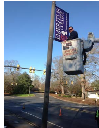
Emeritus Banner at Clemson University College

At Emeritus Day held in October, the college announced its first endowment for emeriti, a $25,000 gift to support the Distinguished Emeriti Award, and recognized past award recipients, board members and donors. In December, the yearlong celebration will conclude with a holiday reception and unveiling of a photo book, compiled by emeriti, which depicts the college's history.