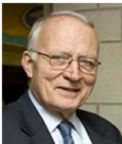
David Durenberger, former U.S. Senator