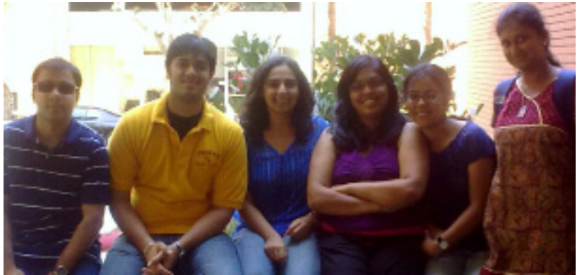
2009 USC Students